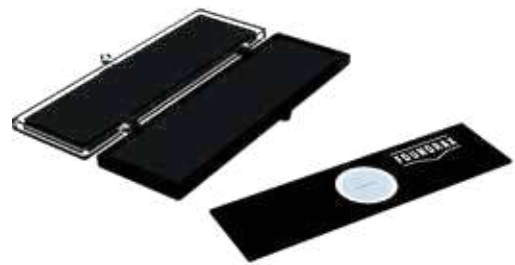
Foundrax Stage Micrometer (certified checking scale)