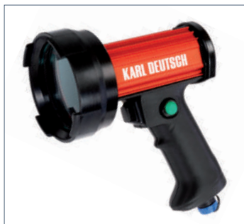
Compact, lightweight UV-LED Hand Lamp with long-life LED technology