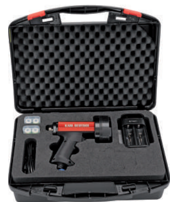
Supplied in a handy carrying case