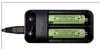
Charger for two commercially available Li-ion high-performance cells included in the set