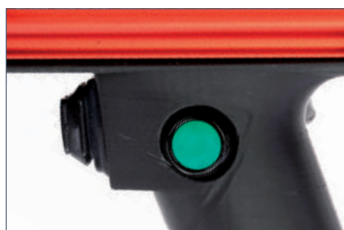
White light switching at the touch of a button