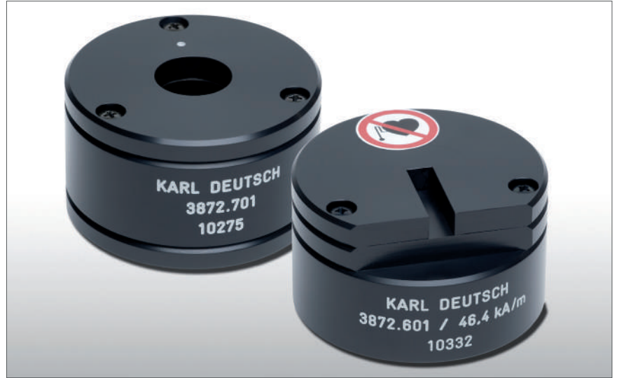
Zero field chamber (left) with field-free inner space and reference magnet with defined field strength are accessories for field strength measurement and used for checking the gauge