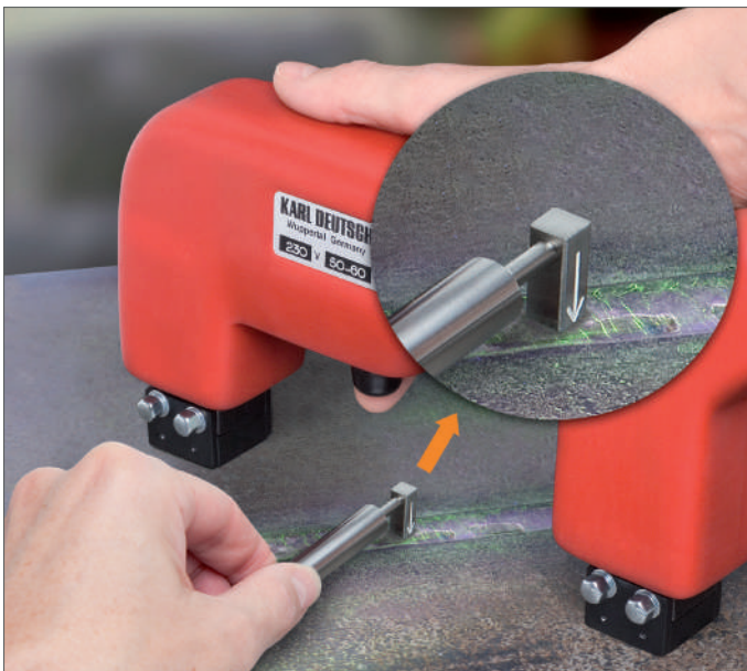
Probe for narrow geometries with transverse fields