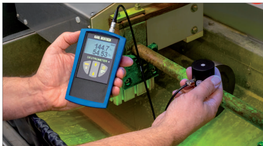
To control the viewing conditions, the DEUTROMETER together with the DEUTROLIGHT probe simultaneously provide the measured values for the residual daylight and the UV intensity