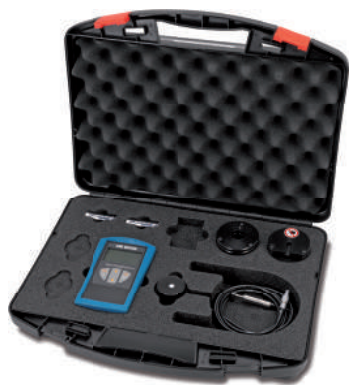
Supplied in a handy carrying case (example picture)

The DEUTROMETER makes it possible to measure field strengths and monitor limit values easily and conveniently. With a special probe, it is also possible to measure UV and white light.