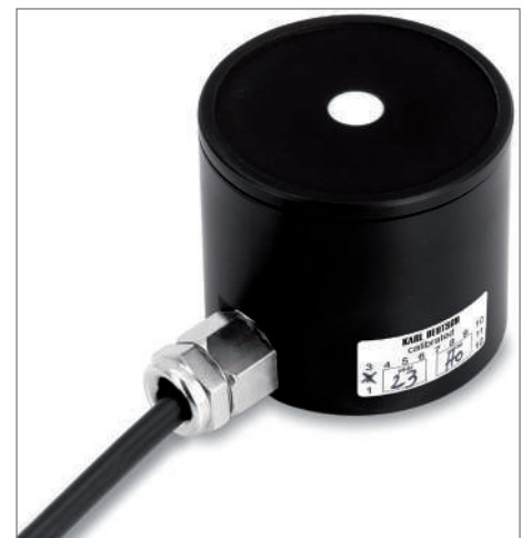
UV and white light probe with translucent diffuser through which the light reaches the measuring unit in the probe