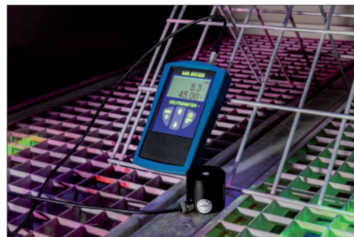
The DEUTROMETER is also the right tool for checking the lighting conditions during PT testing

The DEUTROMETER, thoroughly developed for practical use, helps to determine both measurands quickly and easily: In a separate measuring mode, both the magnetising field strength